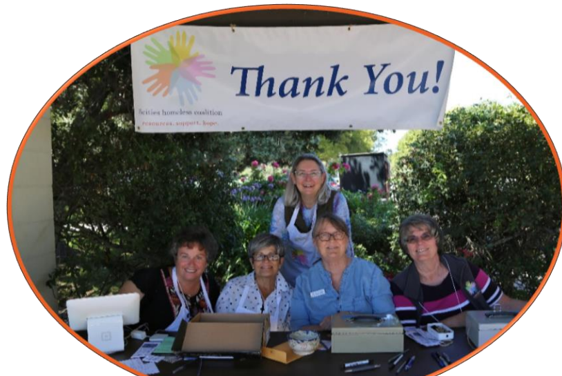
Coalition volunteers and staff members, and those we serve, appreciate your ongoing interest and support.